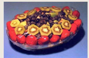
LUAU FRUIT BOWL